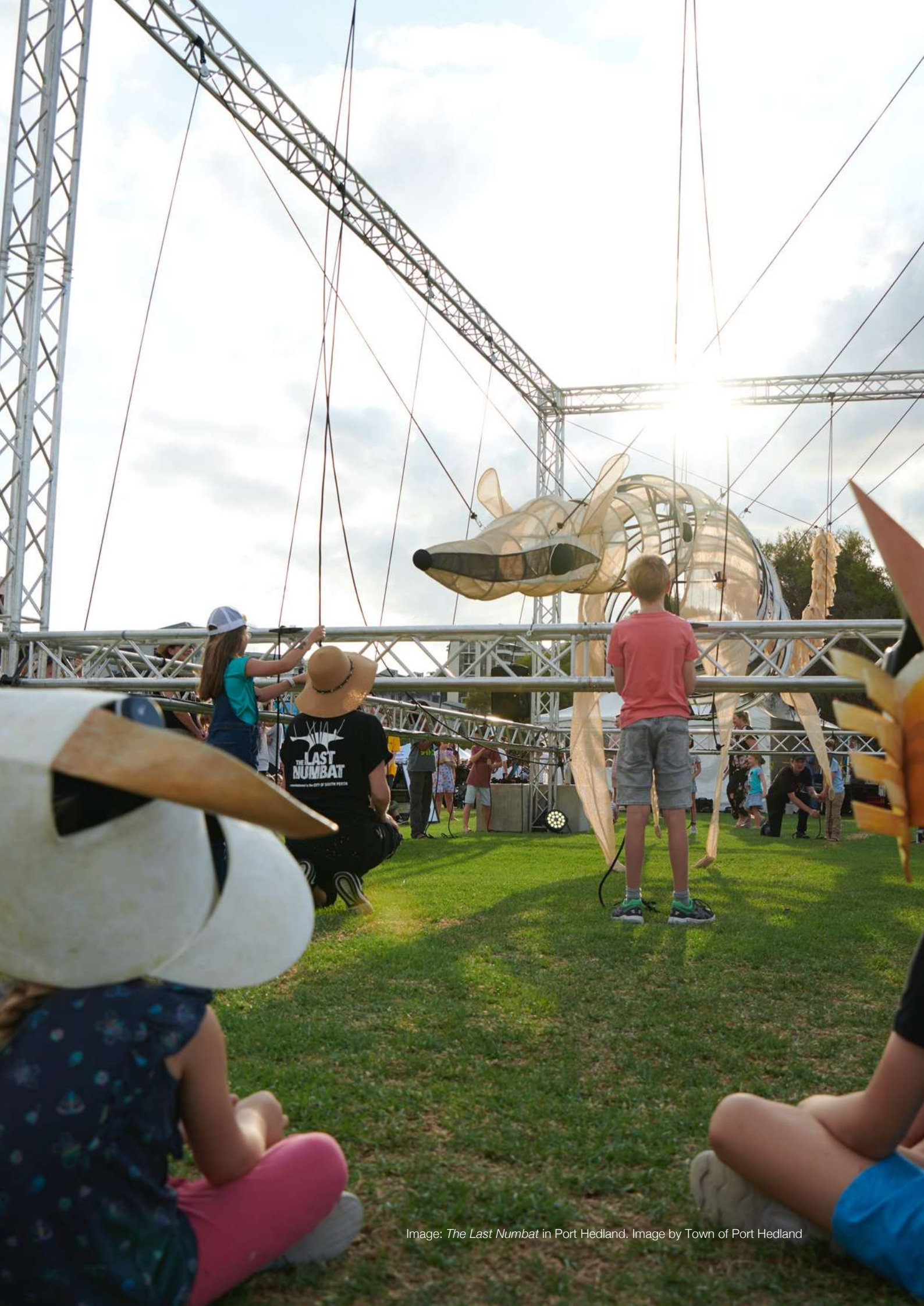
Image: The Last Numbat in Port Hedland.