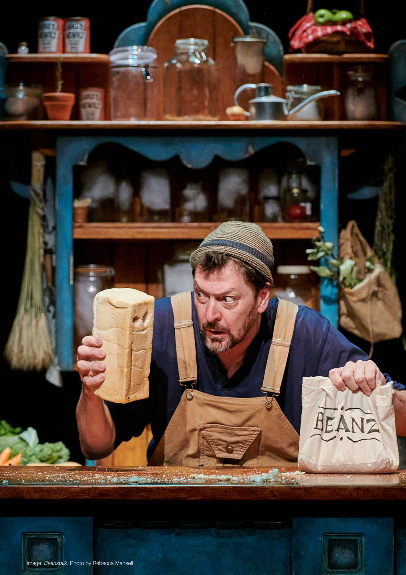
Image: Beanstalk.