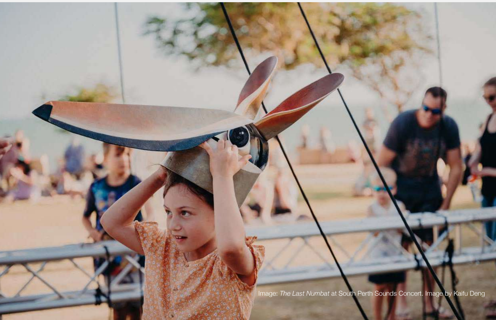
Image: The Last Numbat at South Perth Sounds Concert.