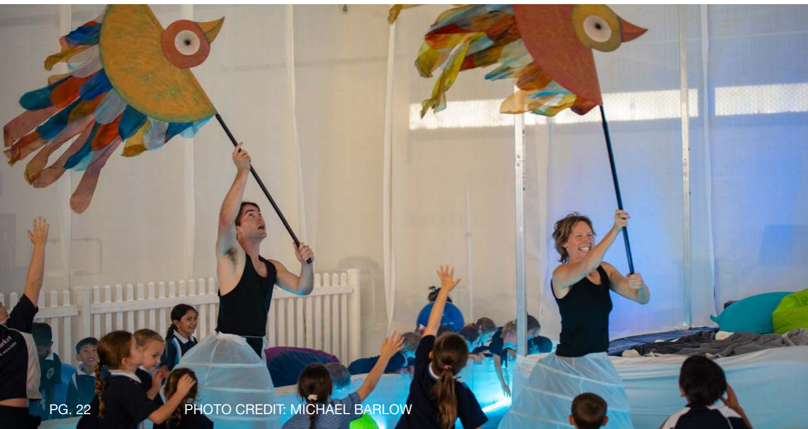
PG. 22